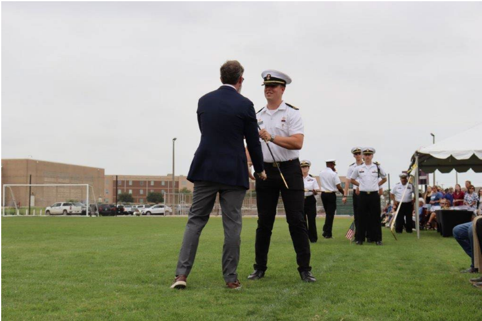
Presentation of swords to new command.