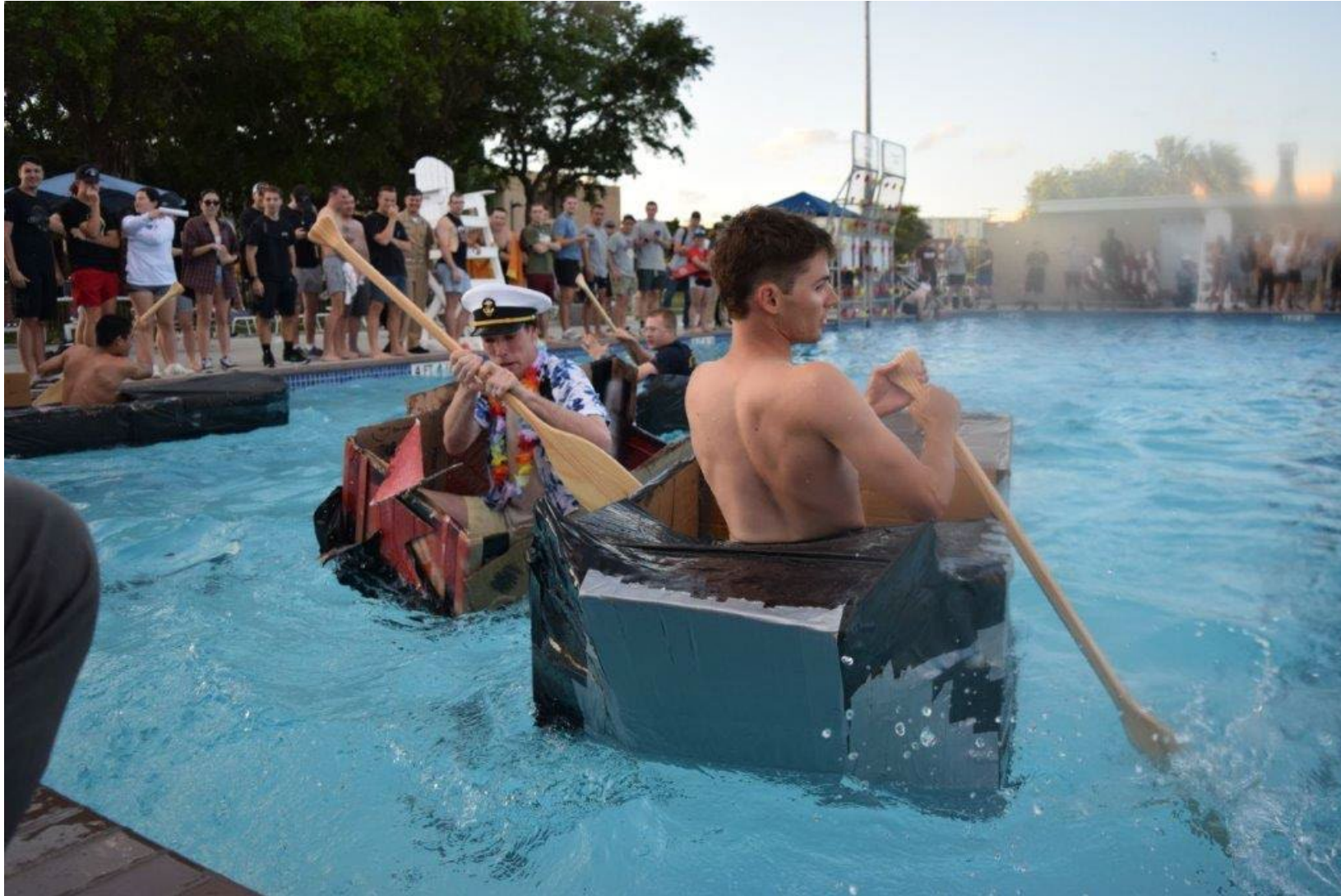
Cardboard and Duct Tape Boat Race.