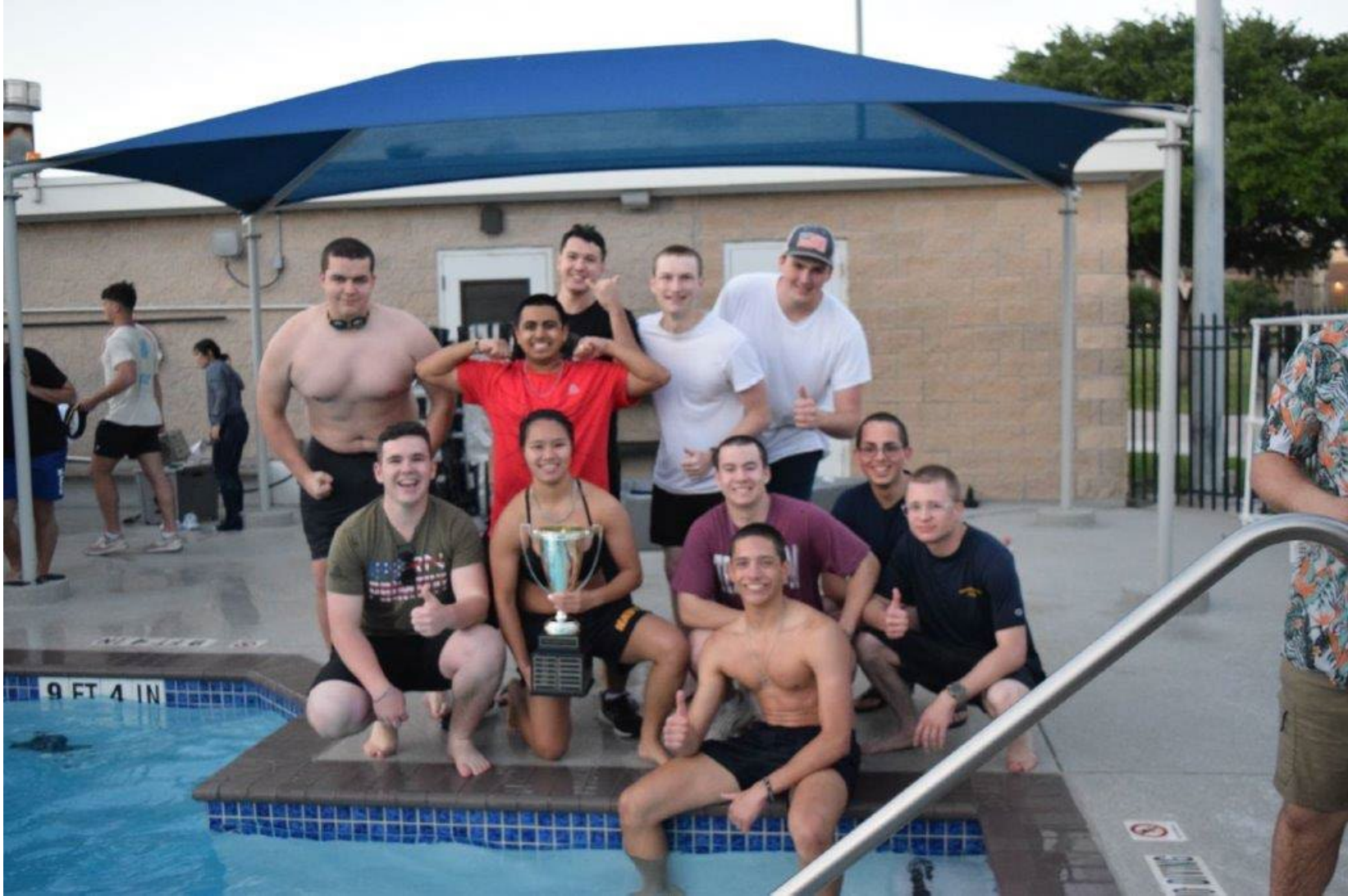
Company Delta 1 posing with their hard-won trophy!