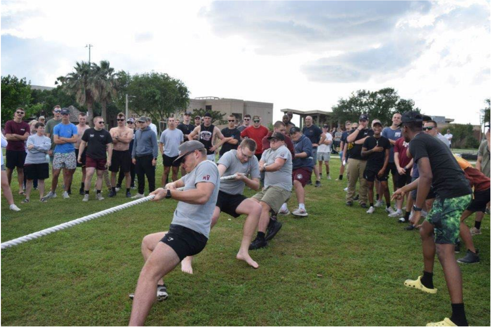
Klenczar Cup Tug of War.