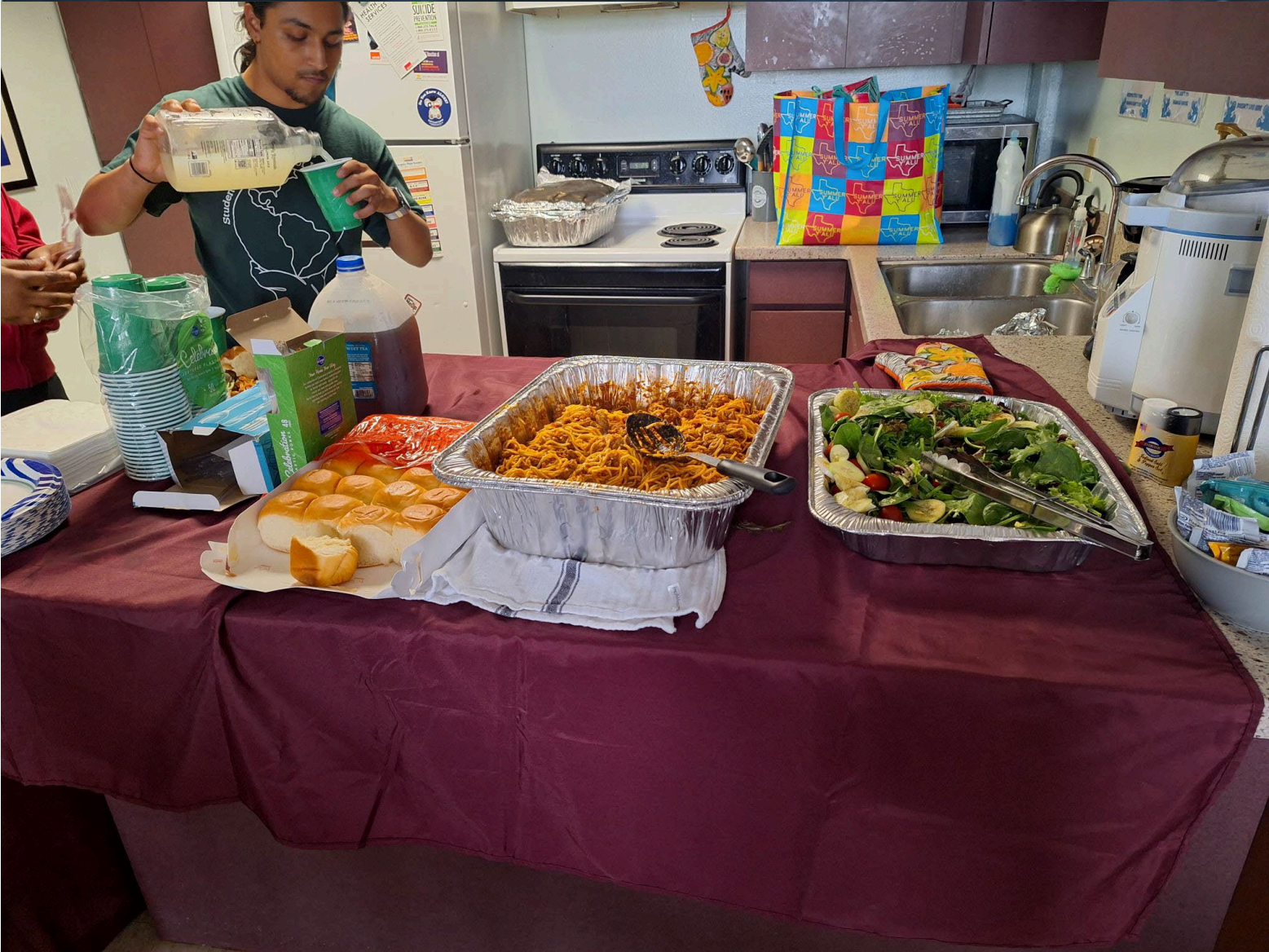
Dinner hosted by the Black Student Alliance.