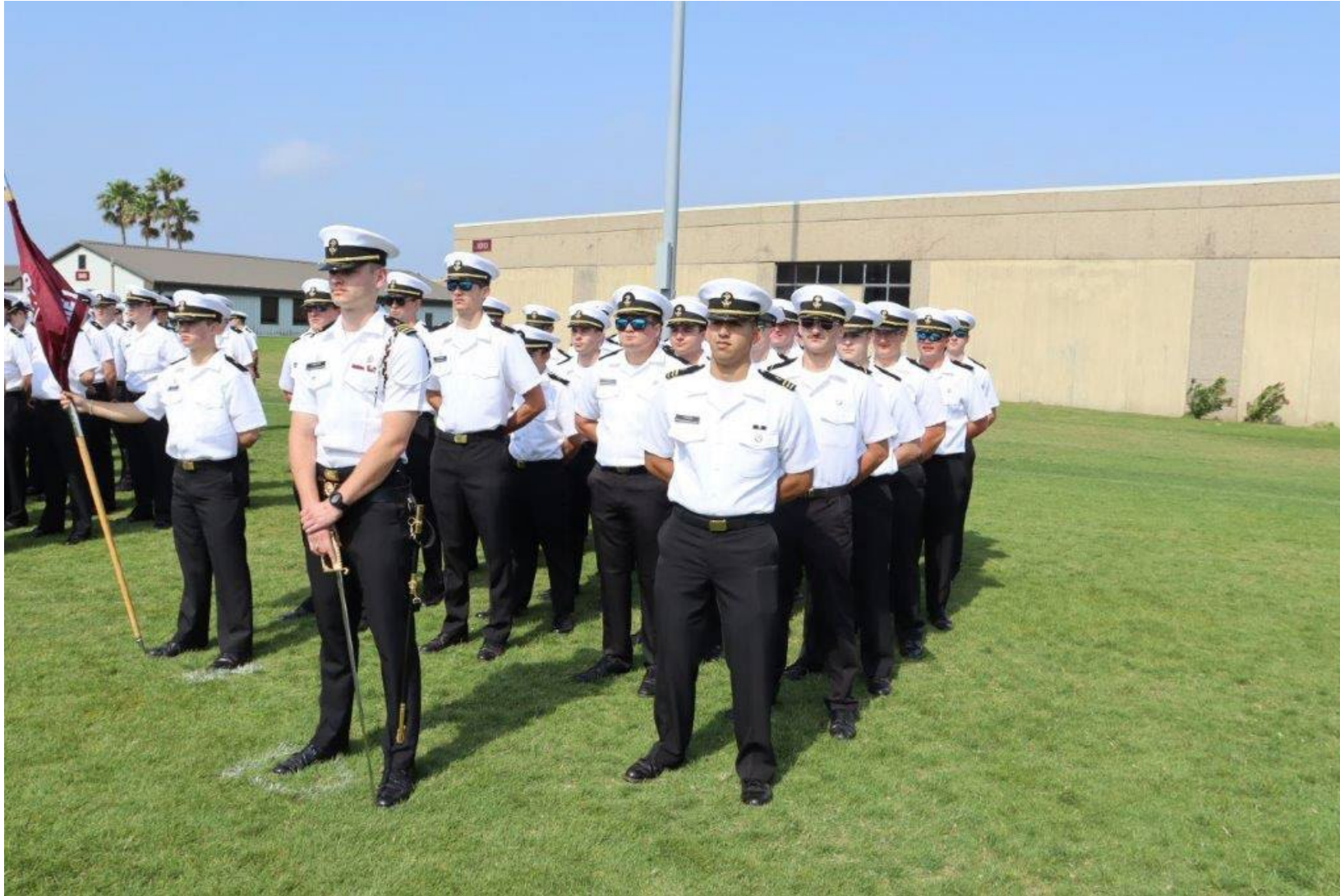
Cadets ready for Change of Command